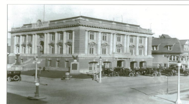
The new city hall opened in 1915 on the corner of Ninth Street and Albany Avenue. The police and firemen also used the building.