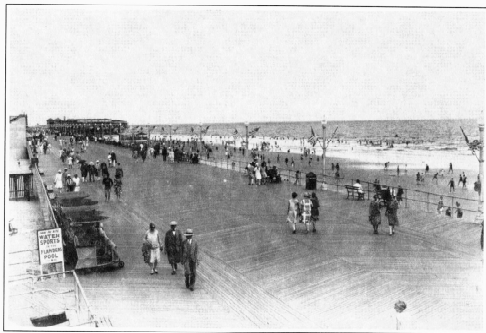
History and Vintage of the Ocean City Boardwalk Ocean City, New Jersey

Ocean City Historical Museum, Inc. 2006 Historical Calendar