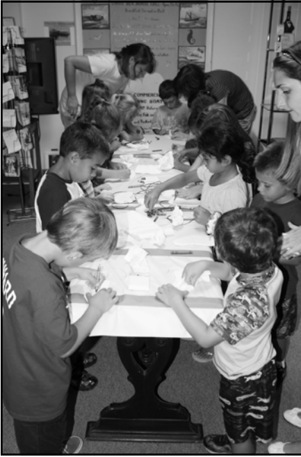
Wednesdays for Kids