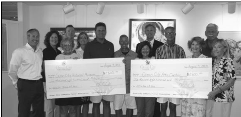
The Museum was a fortunate recipient of $2,900 from the Ocean City Community Center Association's Gala Fundraiser on June 11 th .