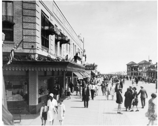
View of the new boardwalk at 9th St in July of 1928

Dairy Maid Candy in Philadelphia which belonged to the Glaser family, as well as James Salt Water Taffy. Soon, Fralinger's also came under the umbrella of the taffy-making families.